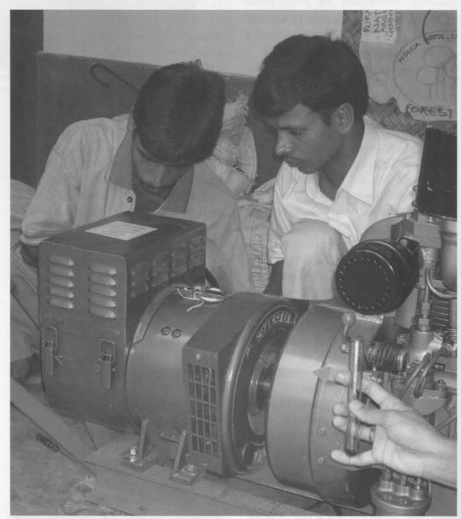
Hands-on training of bare-foot technicians on the biodiesel generator