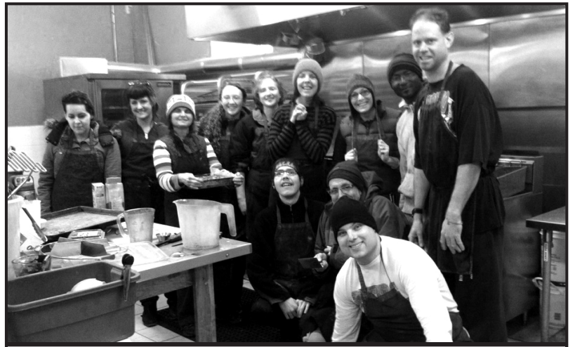
Last winter, a broken heater early in the morning, inspired Maurita's Kitchen workers and volunteers to bundle up as they prepared food for the Queen Street Commons Café.

Through conversations about Buber, Roseto, Geel and Mystagogy in the Local Democracy class this past winter my own understanding and practice has been enlivened. This new year we are running the Diploma in Local Democracy again and I look forward to the new explorations that will occur. There's no predicting what learning will arise but I fully trust that new participants will add their own voice to the wisdom of our group. Will you join us in this collective journey?